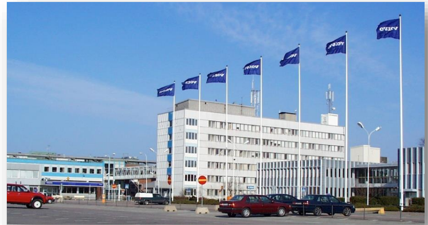
Torslanda – Industry