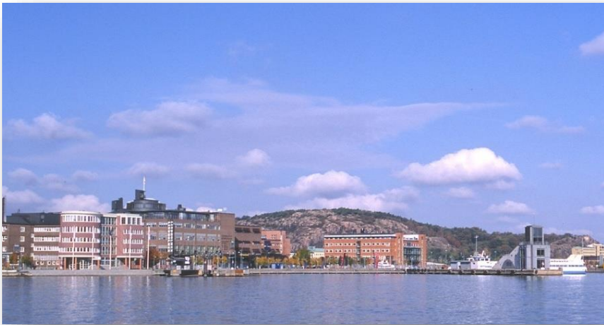
Lindholmen – Academy